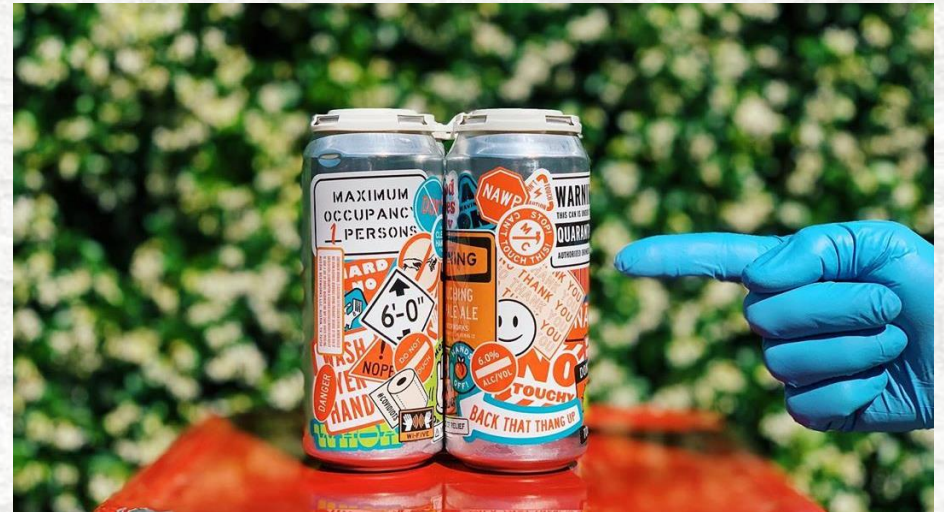
St Elmo Brewing & Austin Beerworks Zoom Collabs