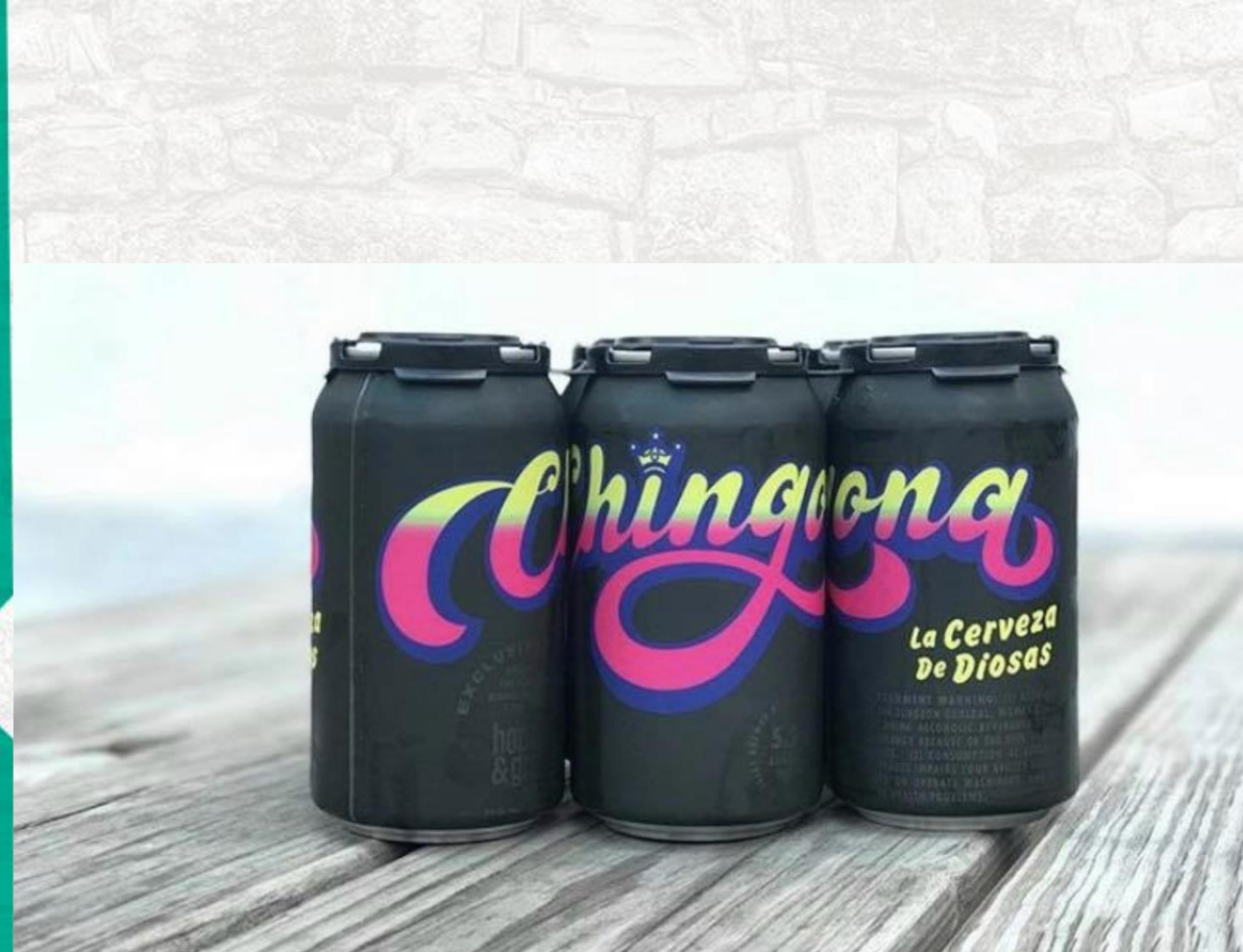
Chingona Fest beer – Hops & Grain Brewing